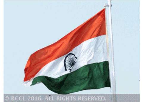
© BCCL 2016. ALL RIGHTS RESERVED.

ET SPECIAL: Love visual aspect of news? Enjoy this exclusive slideshows treat!