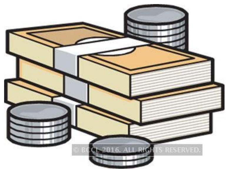
In case of overtime, employers will have to pay workers double the minimum fixed per hour for each hour beyond... Read More

AIPUR: Enforcing labour reforms in the unorganised sector, the Rajasthan government has fixed minimum wages for domestic help and set limits to their working hours.