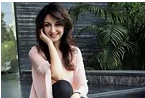
'Bhabhi Ji Ghar Par Hai' actor Saumya Tandon at Cannes! 18/05/2016