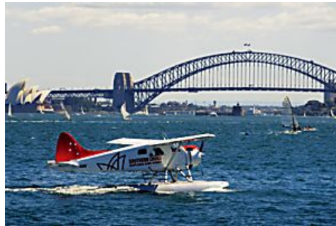
What makes Sydney a joy to explore Tourism Australia