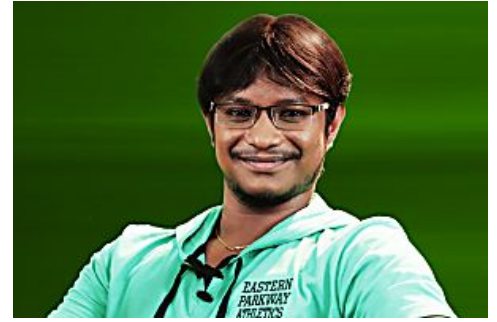
Chennai based IT Engg hits Online Jackpot RummyCircle