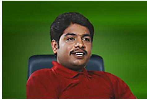
How Online Rummy changed IT Engg's life! RummyCircle