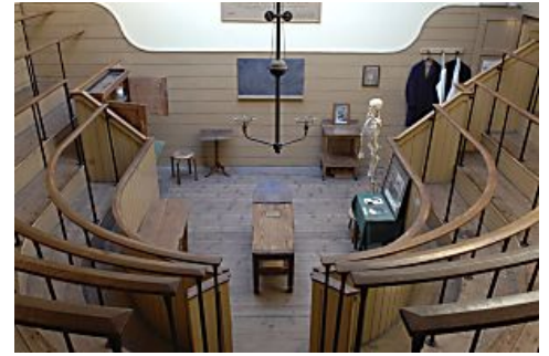
The UK capital has secrets known only to a few Passenger 6A