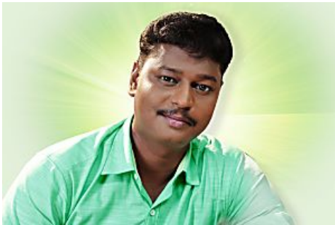
Bangalore guy wins Rs. 10k online every week RummyCircle