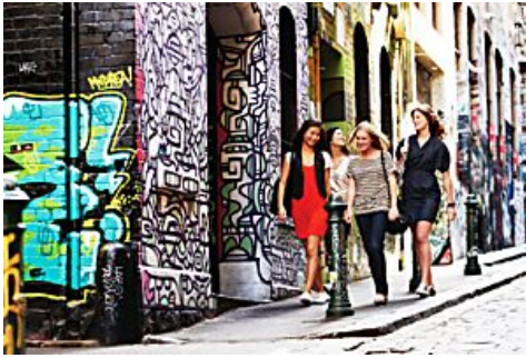
Explore the most livable city in the world Tourism Australia