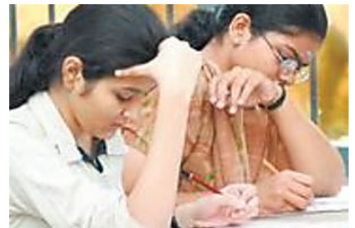
NEET order: what's in store 08/05/2016