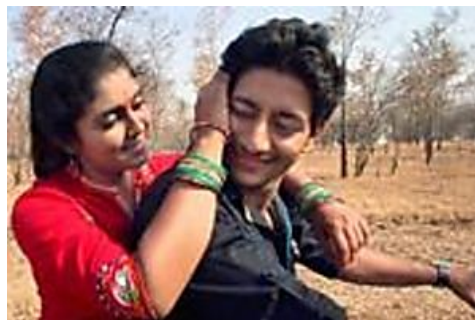
To love against the odds 27/05/2016