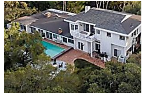
Million Dollar Luxury Homes You Have to See to Believe Mansion Global by Dow Jones