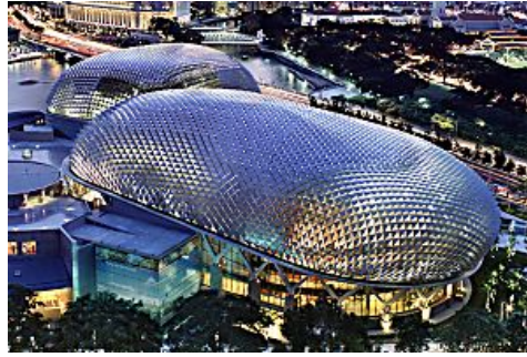
Singapore's Most Unique Buildings Singapore Tourism Board