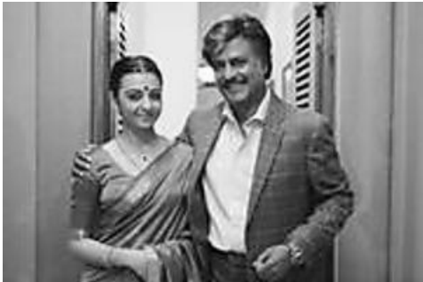
Supporting the Superstar 16/07/2016