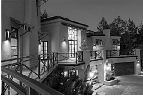
Where the World's Billionaires Live Mansion Global by Dow Jones