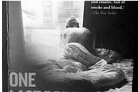
Licit, illicit 23/07/2016