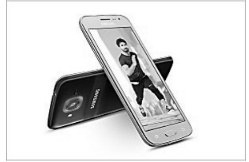
What do multitaskers look for in a smartphone? Samsung J2 on Fone Arena