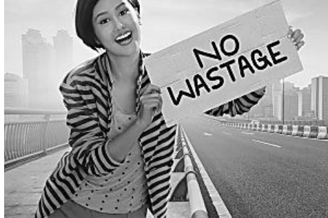
Reduce your mobile bill by 30%! Airtel