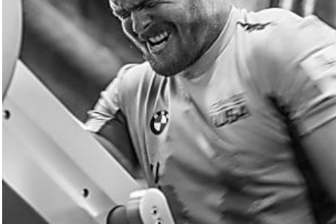
Burning 4000 calories a day can make you a champion Turner Broadcasting System Inc.