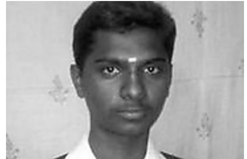
Judge allows video recording of accused in Swathi murder case 30/07/2016