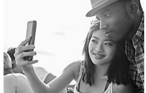
26 Signs a Girl Likes You Men's Fitness