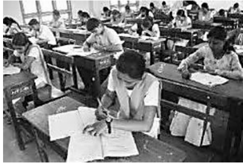
Indian Examination System Requires new approach for Assessments ePravesh