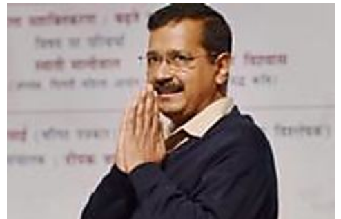
Delhi needs to be a full state: Kejriwal 15/08/2016