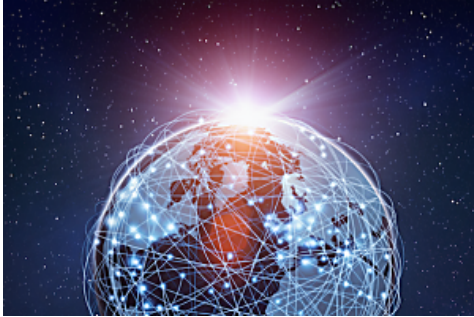
Which country is the most connected? CNN INTERNATIONAL