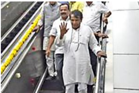
Tilting train may reduce commuting time between Bengaluru and Mysuru 24/07/2016