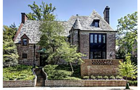
Here's the House Obama Will Live in After He Moves Out of the White House Mansion Global