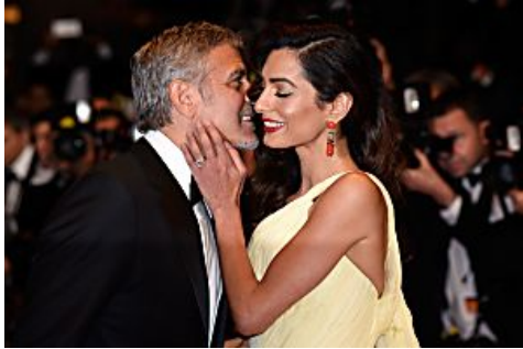
What Do the British Prime Minister and George Clooney Have in Common? Mansion Global