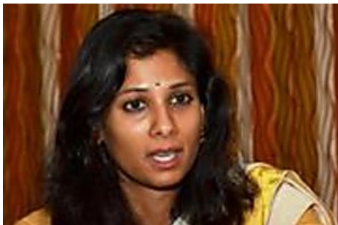
Harvard professor Gita Gopinath's appointment: CPI defends Kerala CM 25/07/2016