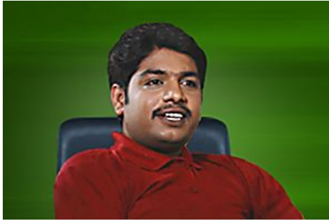
Know how a software engineer surprised his wife! RummyCircle