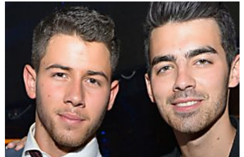
15 Celeb Siblings Who Go Unnoticed Daily UberHavoc