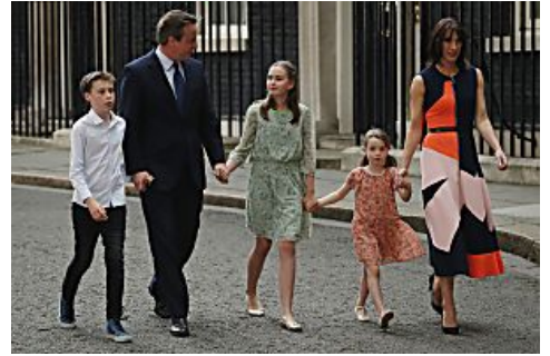
Temporary London Homes Suitable for David Cameron Mansion Global