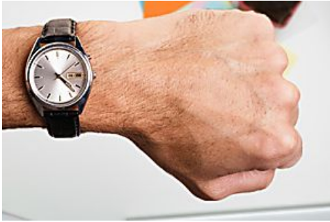
Are you charging an appropriate rate for your skills, education and experience? Find out! Payoneer.com