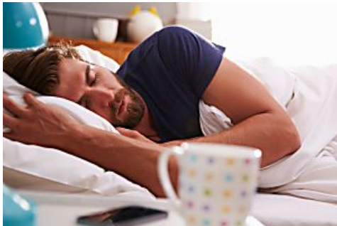
15 Natural Ways (That Aren't Melatonin) to Fall Asleep Faster Men's Fitness