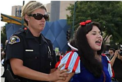
The Most Insane Things People Have Witnessed At Disney Viral Thread