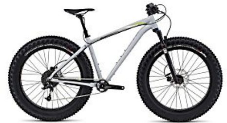
10 Best Road Bikes For Serious Cyclists Men's Fitness