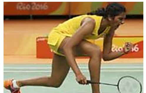
Who is PV Sindhu — India's badminton heroine in Rio 18/08/2016