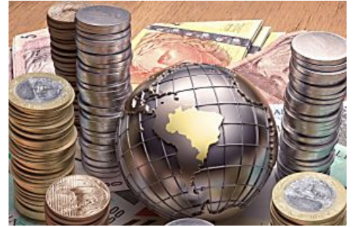
A Blueprint for Brazil's Fiscal Reforms TheFinancialist by Credit Suisse