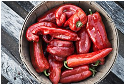
How to Eat Your Way to Glowing Skin Men's Fitness