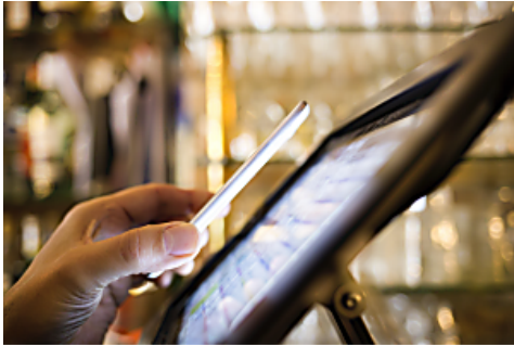
Big data is making your life better. Find out how CNN INTERNATIONAL