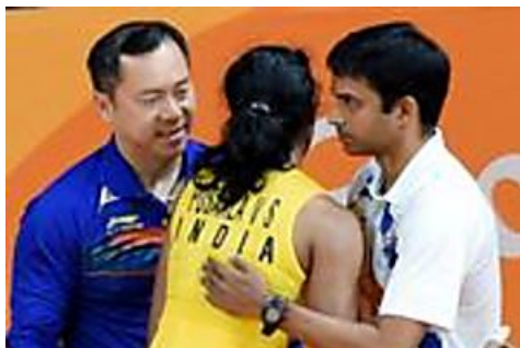
The saga of a selfless coach 20/08/2016