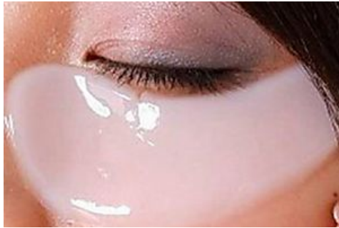
Say Goodbye to Botox? Mother 57, Looks 35 Without Surgery Health News Online