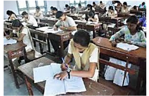
Indian Examination System Requires new approach for Assessments ePravesh