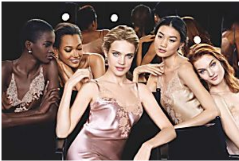
Fresh and flawless: Guerlain Lingerie De Peau Natural Perfection Foundation LifestyleAsia