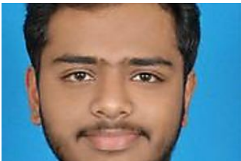
Bengaluru students bag national ranks 17/08/2016