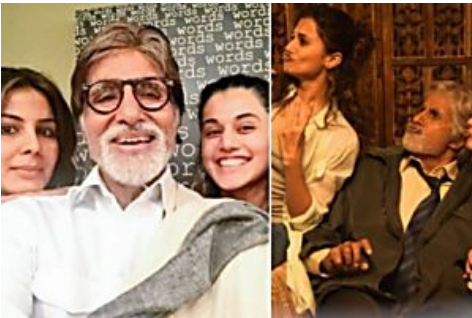
5 Reasons Why You Should Definitely Watch Amitabh Bachchan's Pink LiveInStyle by USL - Diageo