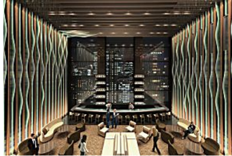
See Tokyo like Never Before Momentum