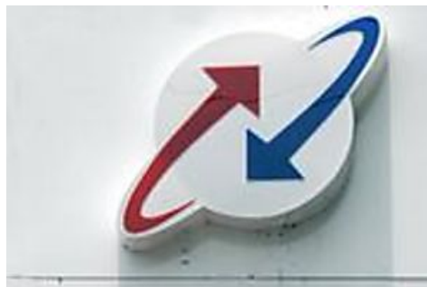
Will match Reliance Jio 'tariff-by-tariff', says BSNL 06/09/2016