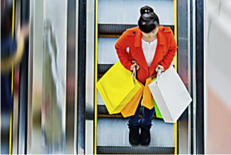
Death of a shopping mall? CNN INTERNATIONAL