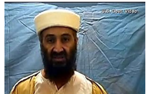
So, who won the War on Terror? 11/09/2016