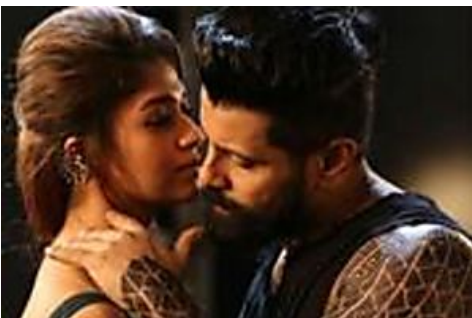
'I wanted to bring The Joker to our audiences' 03/09/2016