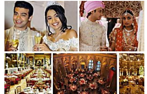
8 big fat Indian weddings that made our jaws drop with their extravageza LiveInStyle by USL - Diageo