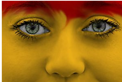
7 Tricks To Learn Any Language In Just 7 Days Babbel