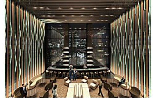
Tokyo's Hidden Neighborhoods Momentum