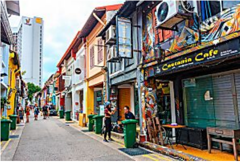
Indie Singapore Momentum