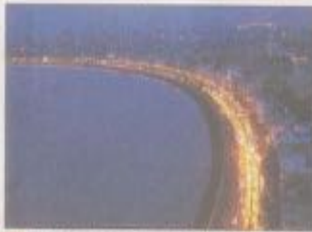
CRZ: The environment ministry has given 60 days for people to make any objections or suggestions on the proposal in the draft notification.

Experts had feared that if the government's proposal decided that