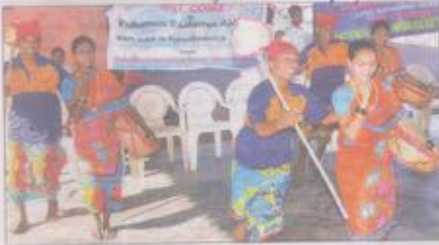
ప్రజాసాహిత్య పరిషత్తు అధ్యక్షులవద్ద భక్తి కళాకార దండ ముద్రణ.